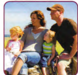
Family income benefit