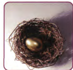
Increased ISA limits