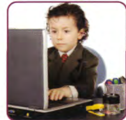
Helping future generations